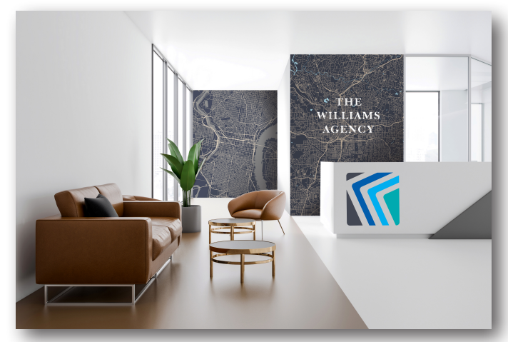
Vinyl Wall Graphics & Cut Vinyl