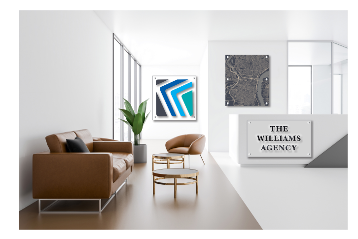
Acrylic Mounted with Stand-Offs