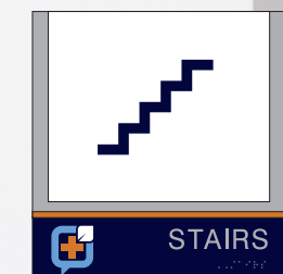
STAIRS REGULATORY (J)